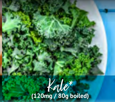
Kale* (120mg / 80g boiled)

A balanced and varied diet should provide enough calcium to meet our requirements. If you take a calcium supplement, make sure your total intake doesn't exceed 1500mg/day as this may cause stomach pain and diarrhoea.