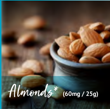
Almonds* (60mg / 25g)