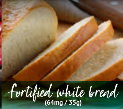
Fortified white bread (64mg / 35g)