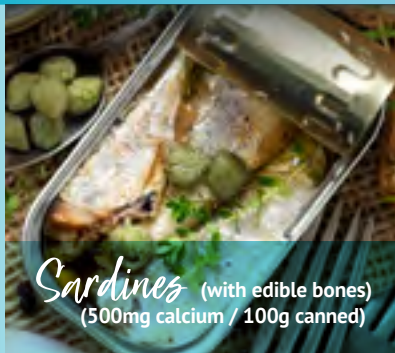
Sardines (with edible bones) (500mg calcium / 100g canned)