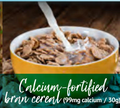
Calcium-fortified bran cereal (99mg calcium / 30g)