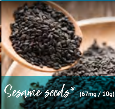
Sesame seeds* (67mg / 10g)