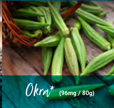
Okra* (96mg / 80g)