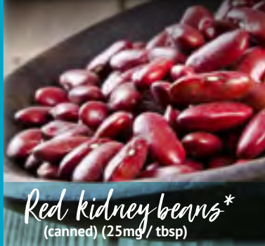
Red kidney beans* (canned) (25mg / tbsp)